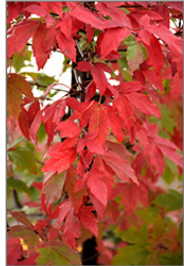
Paperbark Maple in fall