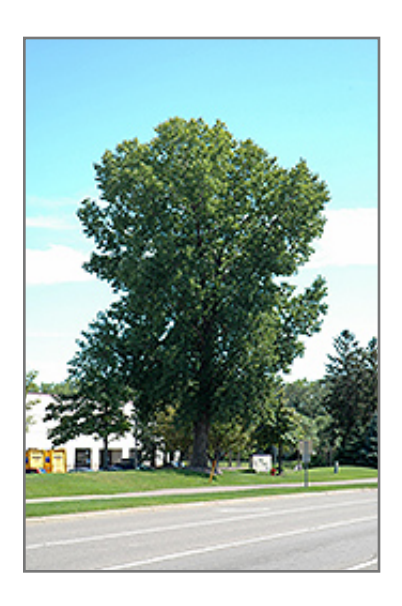
Siouxland Poplar