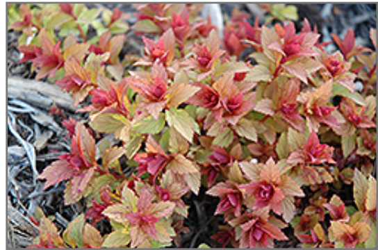
Magic Carpet Spirea foliage