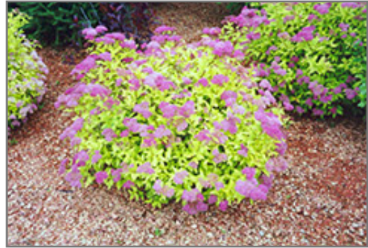
Goldmound Spirea in bloom