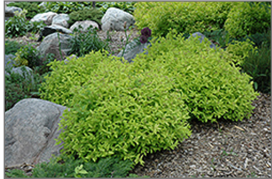
Goldmound Spirea