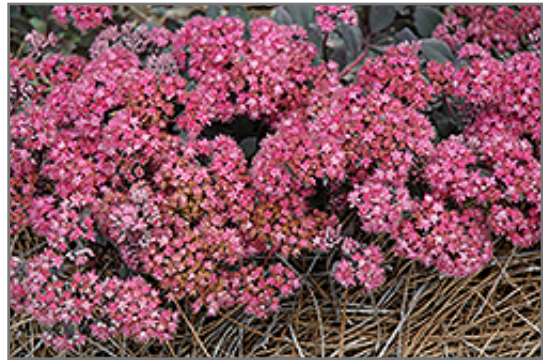
SunSparkler Dazzleberry Stonecrop flowers

SunSparkler Dazzleberry Stonecrop is a dense herbaceous perennial with an upright spreading habit of growth. Its medium texture blends into the garden, but can always be balanced by a couple of finer or coarser plants for an effective composition.