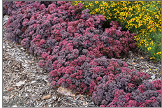
SunSparkler Dazzleberry Stonecrop in bloom