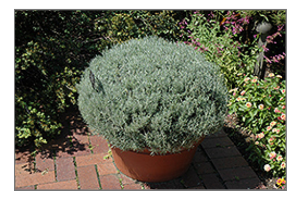
Curry Plant