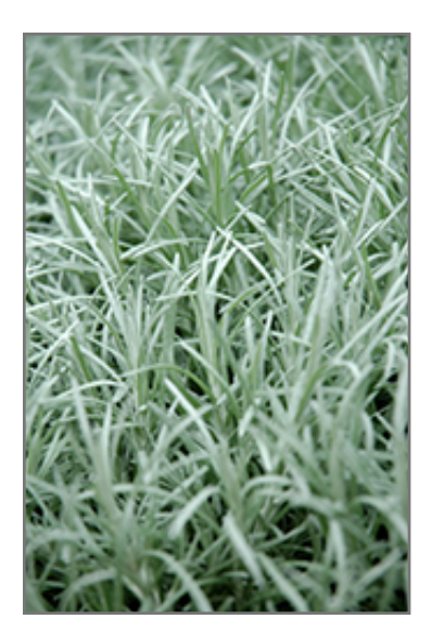
Curry Plant foliage

7777 N. 76th Street Milwaukee, WI 53223 Phone: 414.354.4830 800. 236.4830