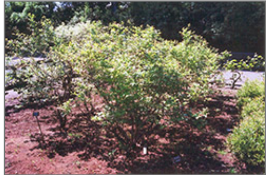
Northland Blueberry