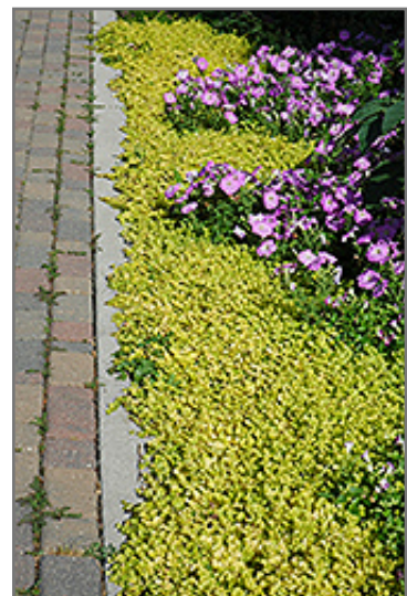
Golden Creeping Jenny / Golden Moneywort