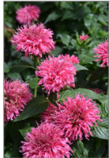
Sugar Buzz Bubblegum Blast Beebalm flowers