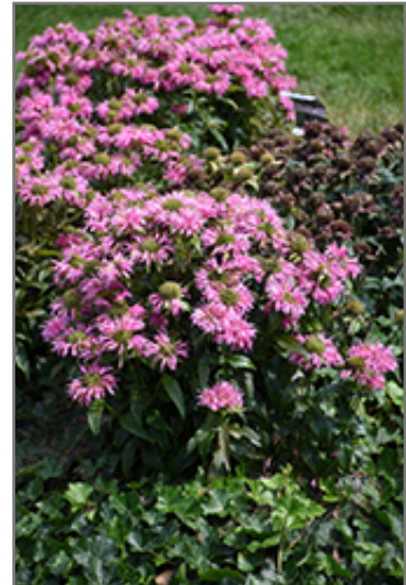
Pardon My Pink Beebalm in bloom