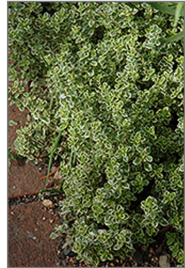
Variegated Lemon Thyme foliage