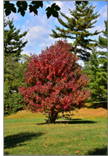
Redpointe Red Maple in fall