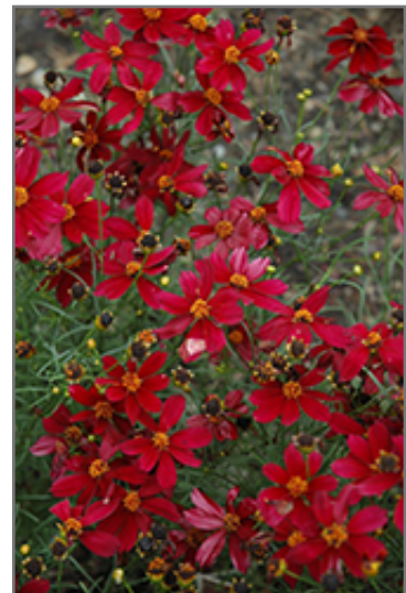
Permathread Red Satin Tickseed in bloom