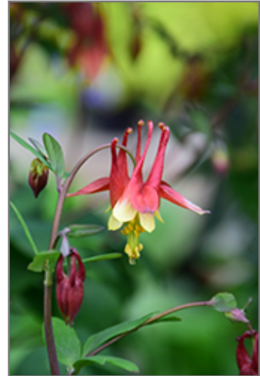
American / Wild Columbine flowers

American / Wild Columbine is recommended for the following landscape applications;