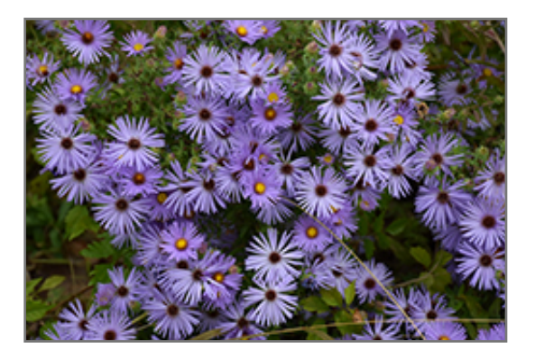
October Skies Aster flowers

7777 N. 76th Street Milwaukee, WI 53223 Phone: 414.354.4830 800.236.4830