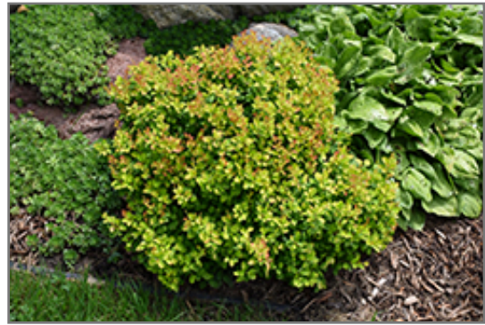
Limoncello Barberry

Limoncello Barberry is recommended for the following landscape applications;