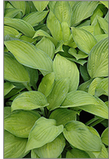
Gold Standard Hosta foliage