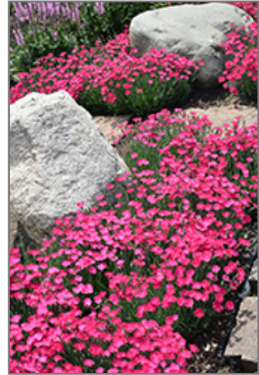
Paint The Town Magenta Pinks in bloom

This is a relatively low maintenance plant, and is best cleaned up in early spring before it resumes active growth for the season. It is a good choice for attracting bees and butterflies to your yard, but is not particularly attractive to deer who tend to leave it alone in favor of tastier treats. It has no significant negative characteristics.