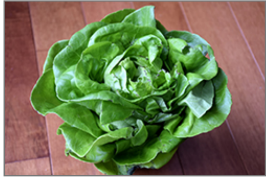
Buttercrunch Lettuce

Buttercrunch Lettuce will grow to be about 12 inches tall at maturity, with a spread of 6 inches. When planted in rows, individual plants should be spaced approximately 8 inches apart. This vegetable plant is an annual, which means that it will grow for one season in your garden and then die after producing a crop. Because of its relatively short time to maturity, it lends itself to a series of successive plantings each staggered by a week or two; this will prolong the effective harvest period.