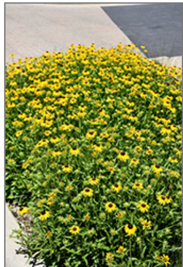
Viette's Little Suzy Showy Coneflower in bloom