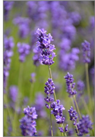
Imperial Gem Lavender flowers

Imperial Gem Lavender is recommended for the following landscape applications;