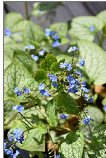
Jack of Diamonds Bugloss flowers

Jack of Diamonds Bugloss is recommended for the following landscape applications;