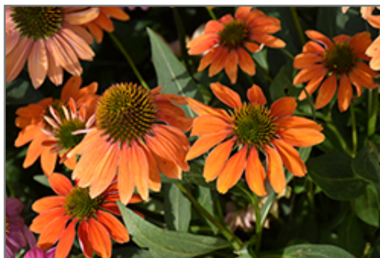
Artisan Soft Orange Coneflower flowers

Artisan Soft Orange Coneflower is recommended for the following landscape applications;