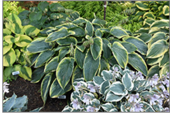
Shadowland Wu-La-La Hosta

This is a relatively low maintenance plant, and is best cleaned up in early spring before it resumes active growth for the season. Gardeners should be aware of the following characteristic(s) that may warrant special consideration;