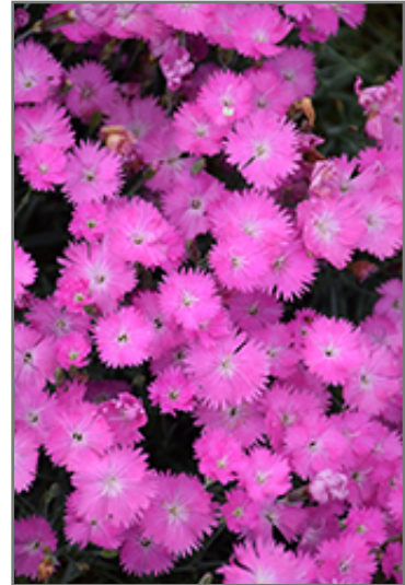
Firewitch Cheddar Pinks flowers