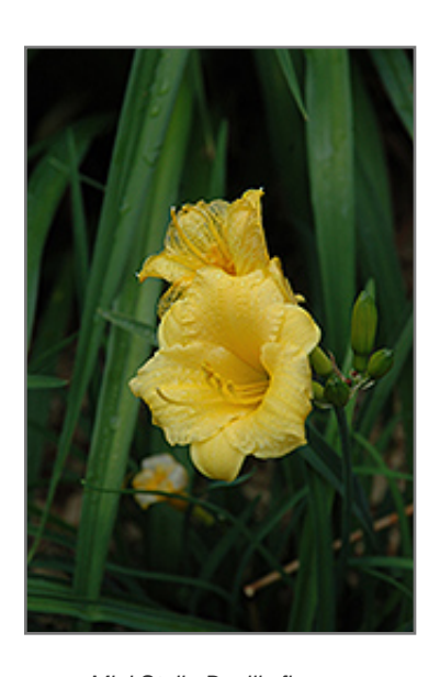
Mini Stella Daylily flowers

Mini Stella Daylily will grow to be about 10 inches tall at maturity, with a spread of 18 inches. When grown in masses or used as a bedding plant, individual plants should be spaced approximately 14 inches apart. Its foliage tends to remain low and dense right to the ground. It grows at a medium rate, and under ideal conditions can be expected to live for approximately 10 years. As an herbaceous perennial, this plant will usually die back to the crown each winter, and will regrow from the base each spring. Be careful not to disturb the crown in late winter when it may not be readily seen!