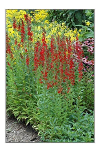
Cardinal Flower in bloom