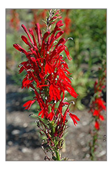
Cardinal Flower flowers