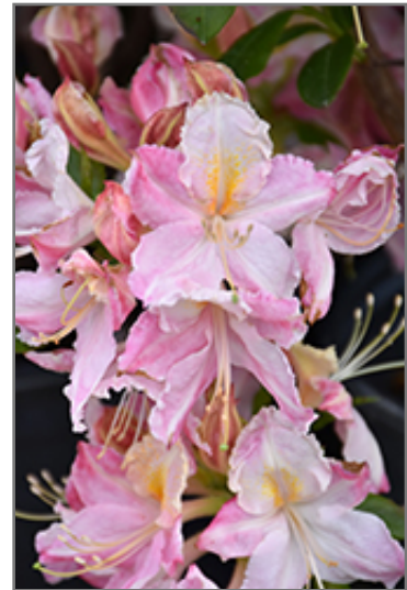
Tri-Lights Azalea flowers