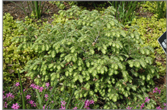
Moon Frost Hemlock

Moon Frost Hemlock is recommended for the following landscape applications;