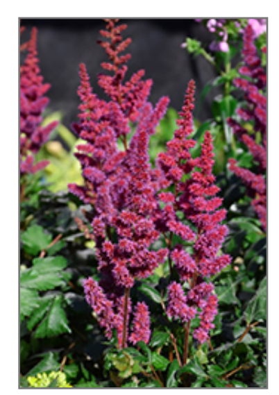
Vision in Red Astilbe flowers