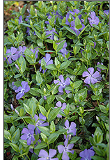
Dart's Blue Periwinkle flowers

Dart's Blue Periwinkle is recommended for the following landscape applications;