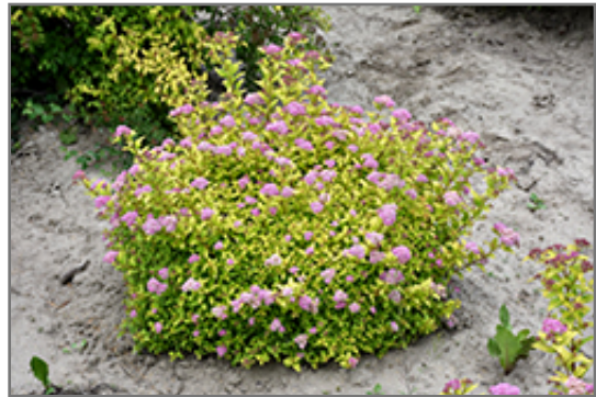
Sundrop Spiraea in bloom