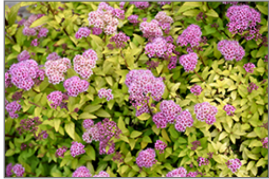
Sundrop Spiraea flowers

Sundrop Spiraea is recommended for the following landscape applications;