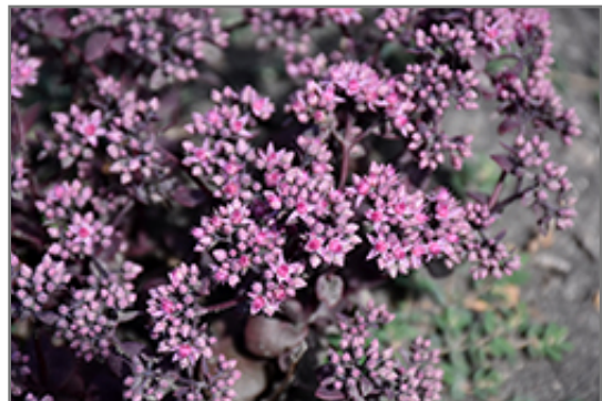
Elizabeth / Red Carpet Stonecrop flowers