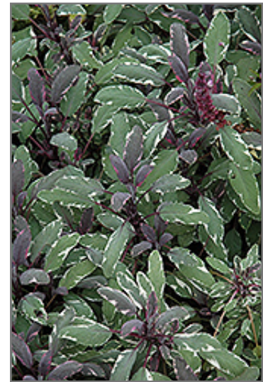
Tricolor Sage foliage