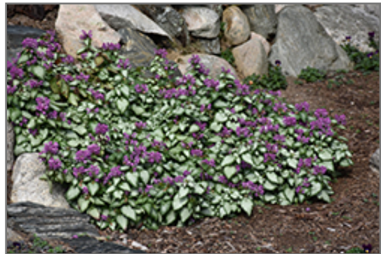
Purple Dragon Spotted Nettle in bloom