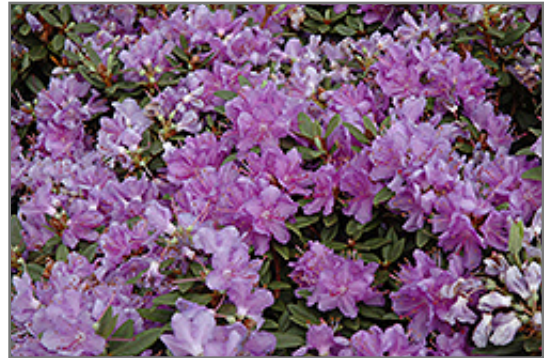
Purple Gem Rhododendron flowers