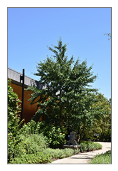
Autumn Gold Ginkgo

7777 N. 76th Street Milwaukee, WI 53223 Phone: 414.354.4830 800. 236.4830