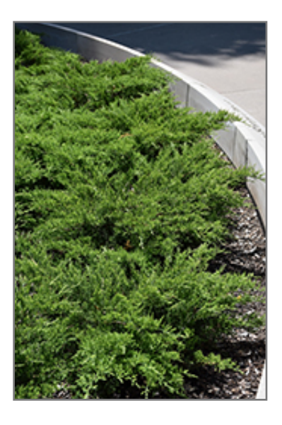
Broadmoor Juniper