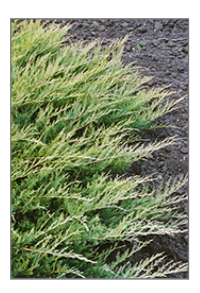
Broadmoor Juniper foliage