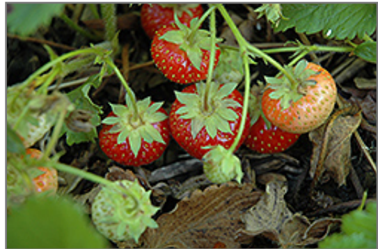
Wild Strawberry

Wild Strawberry features dainty white cup-shaped flowers with yellow eyes along the stems from late spring to early summer. Its attractive tomentose round compound leaves remain green in color throughout the season. It features an abundance of magnificent cherry red berries from late spring to late summer.