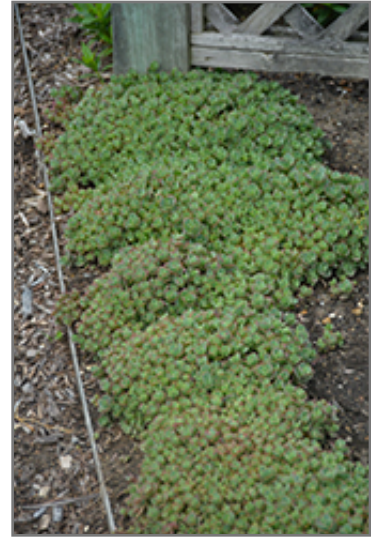
SunSparkler Lime Zinger Stonecrop

SunSparkler Lime Zinger Stonecrop will grow to be only 4 inches tall at maturity extending to 6 inches tall with the flowers, with a spread of 18 inches. When grown in masses or used as a bedding plant, individual plants should be spaced approximately 15 inches apart. Its foliage tends to remain low and dense right to the ground. It grows at a fast rate, and under ideal conditions can be expected to live for approximately 15 years. As an herbaceous perennial, this plant will usually die back to the crown each winter, and will regrow from the base each spring. Be careful not to disturb the crown in late winter when it may not be readily seen!