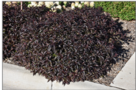
Spilled Wine Weigela