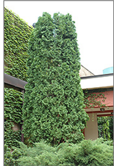
Pyramidal Arborvitae

Pyramidal Arborvitae will grow to be about 25 feet tall at maturity, with a spread of 8 feet. It has a low canopy with a typical clearance of 1 foot from the ground, and is suitable for planting under power lines. It grows at a slow rate, and under ideal conditions can be expected to live for 50 years or more.