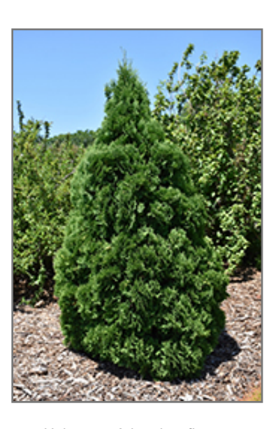
Holmstrup Arborvitae flowers