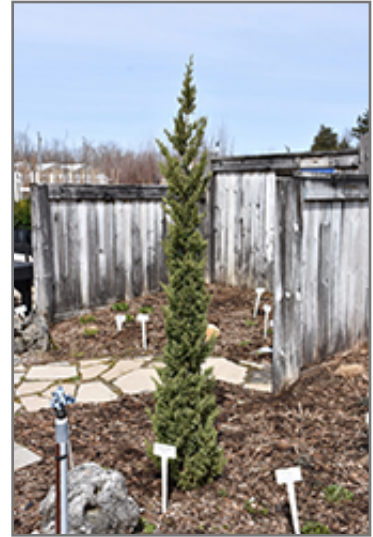
Trautman Juniper

2.5' $71.99 / 3' $99.99 / 4' $139.99 / 5' $164.99