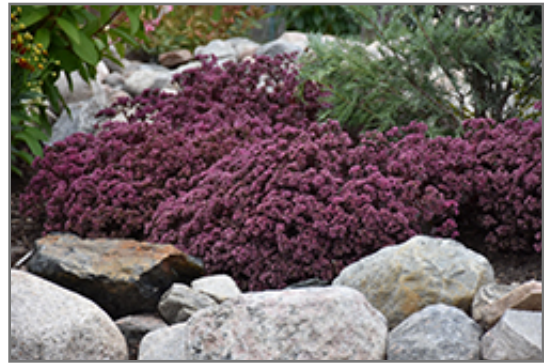
SunSparkler Cherry Tart Stonecrop in bloom

SunSparkler Cherry Tart Stonecrop is a dense herbaceous perennial with an upright spreading habit of growth. Its medium texture blends into the garden, but can always be balanced by a couple of finer or coarser plants for an effective composition.