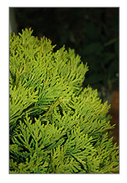
Anna's Magic Ball Arborvitae foliage

7777 N. 76th Street Milwaukee, WI 53223 Phone: 414.354.4830 800. 236.4830