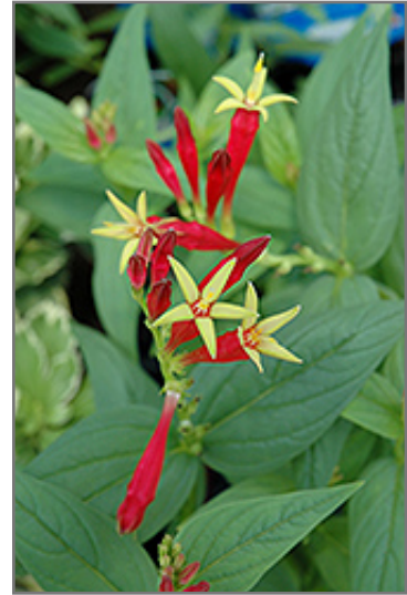
Indian Pink flowers

Indian Pink is recommended for the following landscape applications;