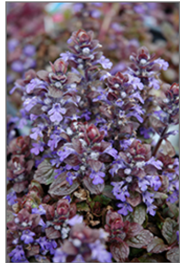
Bronze Beauty Bugleweed flowers