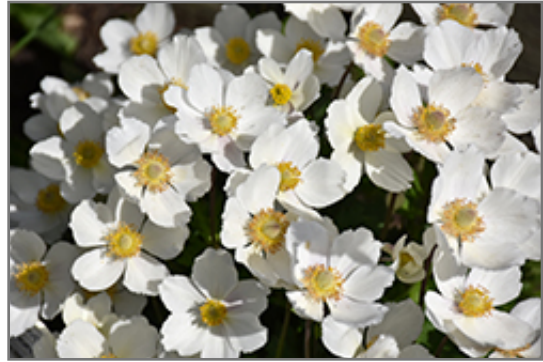
Snowdrop Anemone flowers