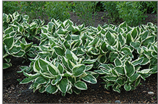
Minuteman Hosta